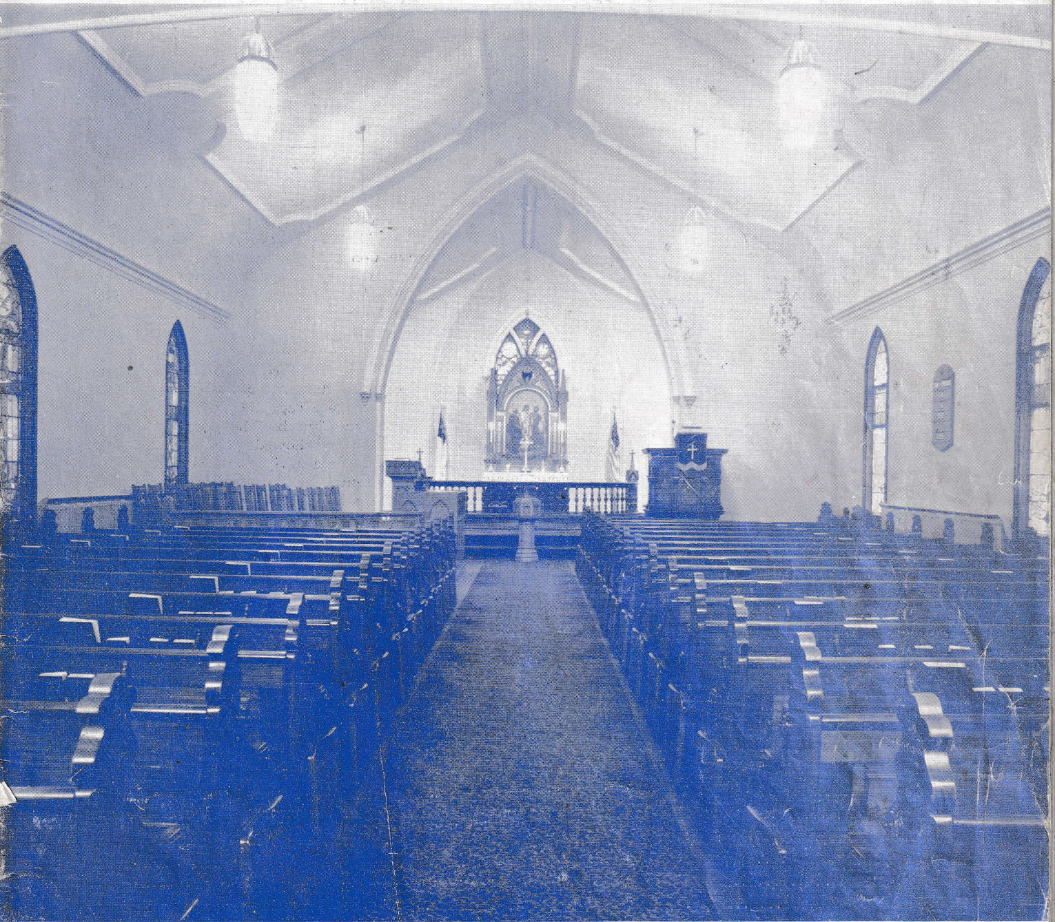
New Interior View of Emmaus Lutheran Church