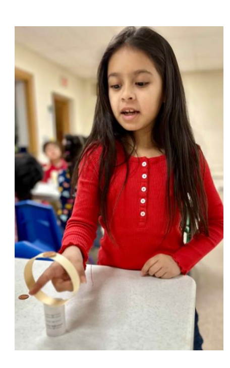
Someone was able to stack 5 pennies atop the hoop and get them all into the cannister. Perseverance!