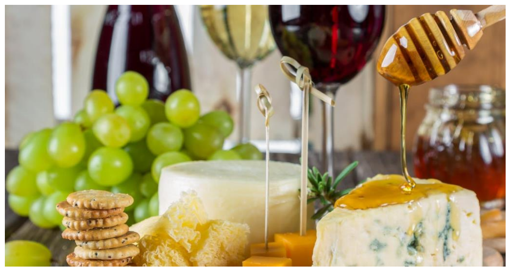
5<sup>th</sup> Annual Wine, Beer or Tequila tasting Fundraiser

Friday March 15<sup>th</sup> has been set for our annual Wine, Beer and Tequila tasting here in Fellowship Hall. Entrance tickets can be purchased here at the church in advance for $28 or at the door for $30. Ticket purchase includes 4 tastings of wine, beer or shots Tequila, plus food and fun. We hope to see you there.