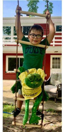
FROG Scavenger Hunt