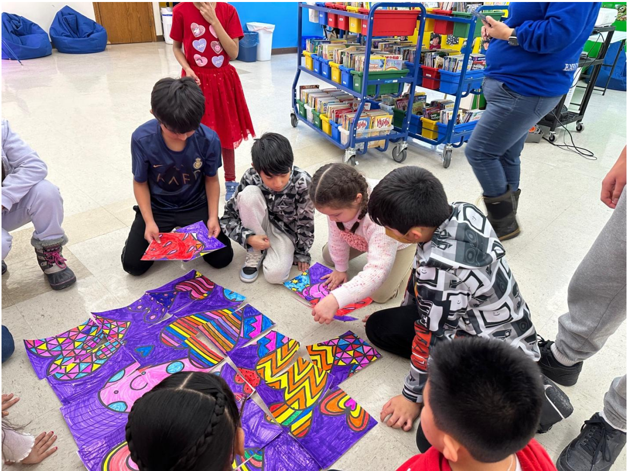
It's a LOVE mural!