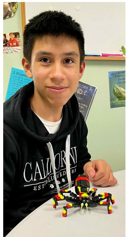
It's a spider!