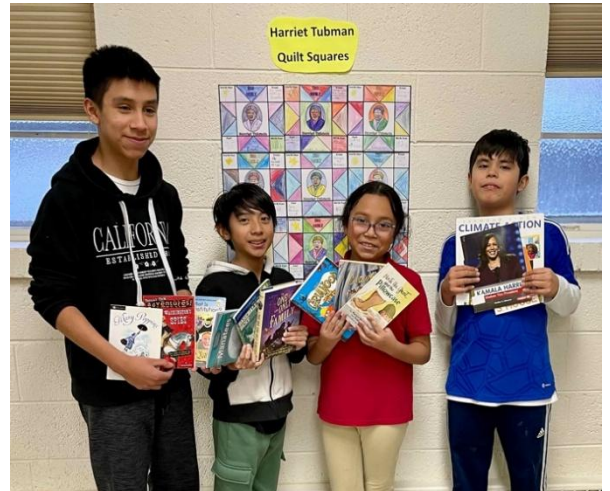
It's a book give-a-way!