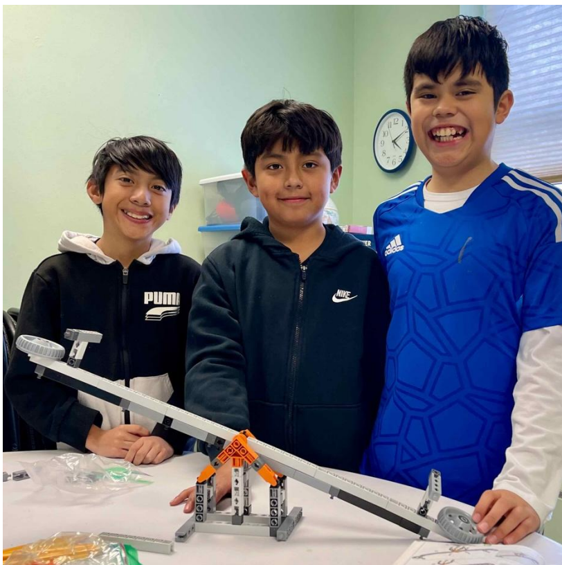
It's a seesaw!