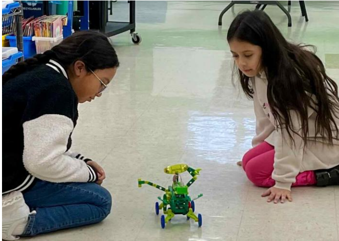
It's a critter that moves!