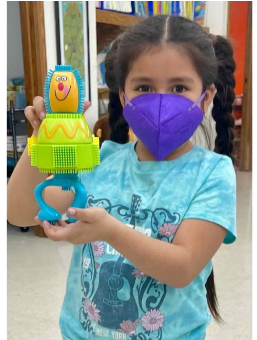
Candids of activities: